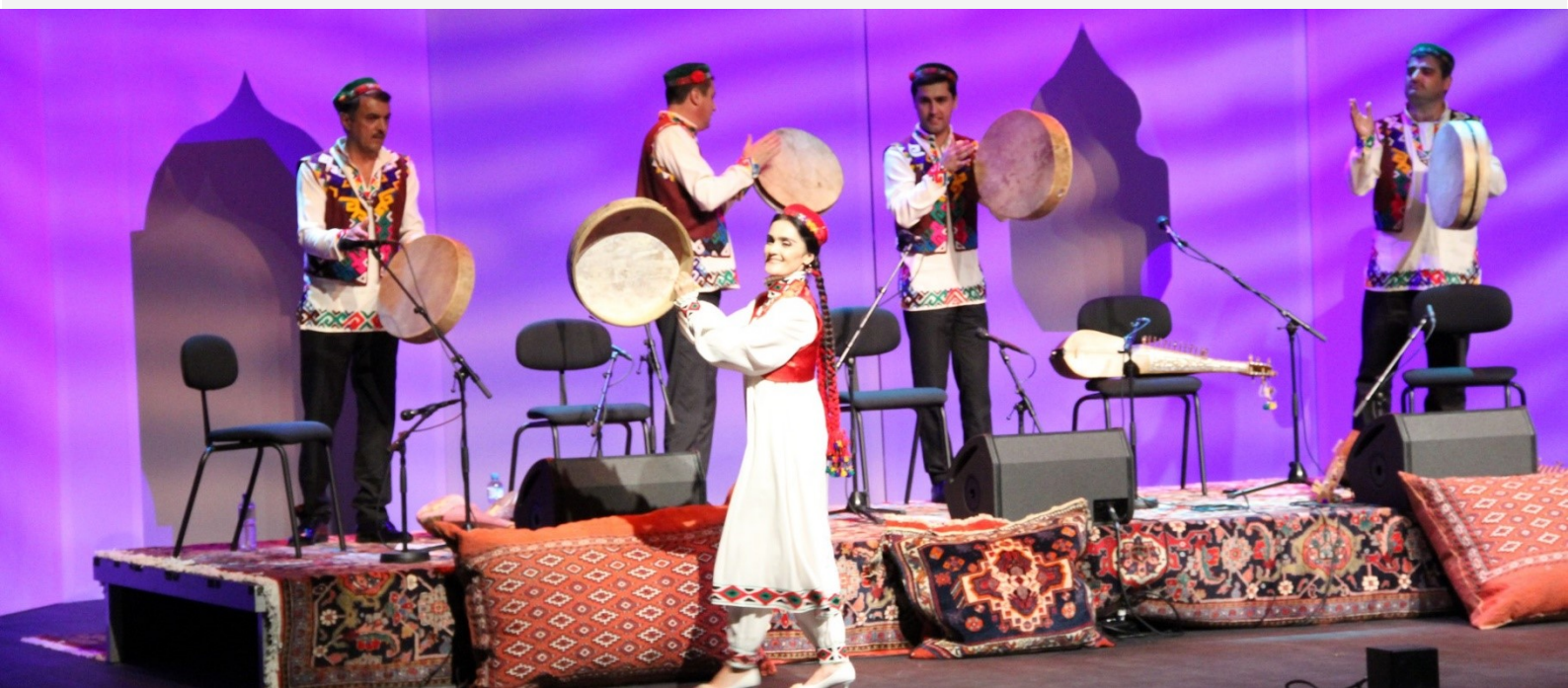
Badakhshani Ensemble during their performance in Paris