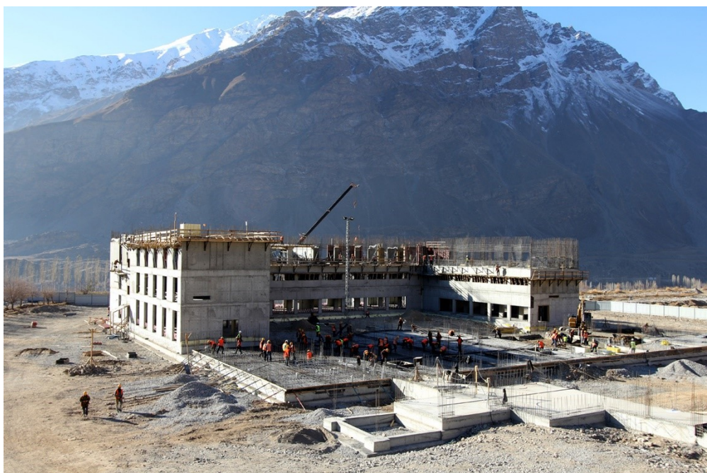
The Khorog Academic Block, which will house a library, classrooms, a computer lab, student common spaces, dining hall, administrative offices and faculty reception, offices and residences.