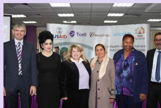
Representatives from TCell, U.S. Embassy, USAID, Mercy Corps

Tcell together with USAID and Mercy Corps and launched Tajikistan's first ever health messaging service called "mHealth." The innovative service uses mobile technology to share important health information with women and their families through text messages, voice recordings, and an information hotline that women can call to ask additional questions related to health and nutrition.