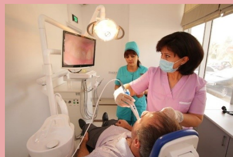
Dental surgeon of the Centre checking a patient

In addition the centre is home to a world class dental clinic, ophthalmology clinic offering eye care for all. The Centre's laboratory is state of the art and will offer biochemistry, immunology and hematology services. The radiology department currently offers Doppler Ultrasound and ECG services, and will offer General Radiology (X-Ray) services as of January 2016. Fully stocked high quality pharmacy is available to accommodate all our patient's needs in the Centre.