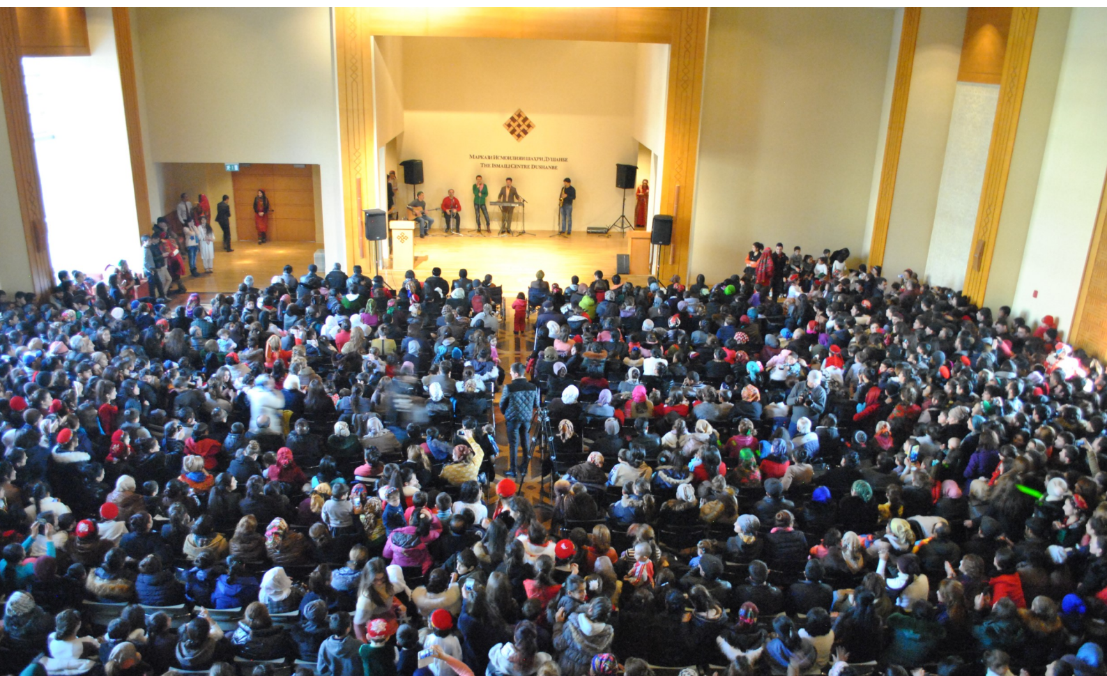
Ismaili Centre Dushanbe

A quiz-game was organised in Khorog where four teams, each comprising of 8 person competed with each other. The quiz questions were divided into three parts, first of which was devoted to Mawlana Hazir Imam's life, the second part was about the institutional activities and third one was on the farmans and irshadat of Mawlana Hazir Imam.