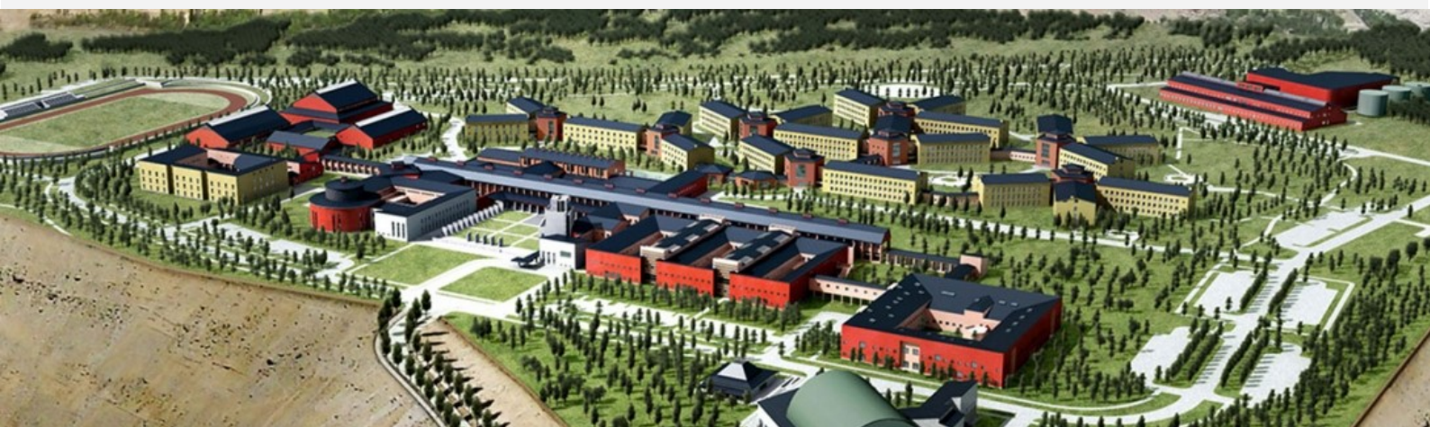
Overall masterplan for the University of Central Asia's Campus in Khorog, Tajikistan.

At a total capital cost of $94.4 million, Phase I construction of the Khorog campus is being funded by a $64.4 million commitment from the Aga Khan Development Network, including $7.5 million from the Aga Khan Foundation, and a long-term soft loan of $30 million from the Overseas Private Investment Corporation, the United States Government's development finance institution.