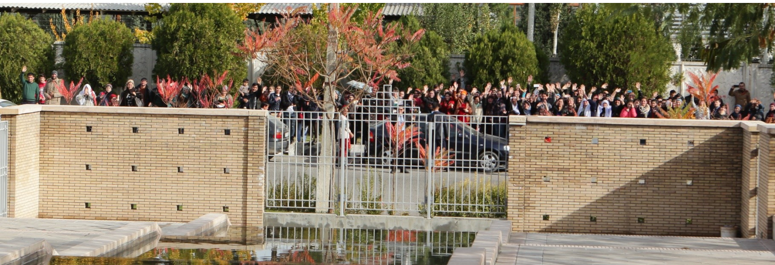
Jamaati Members outside the Ismaili Centre Dushanbe greeting Prince Hussain