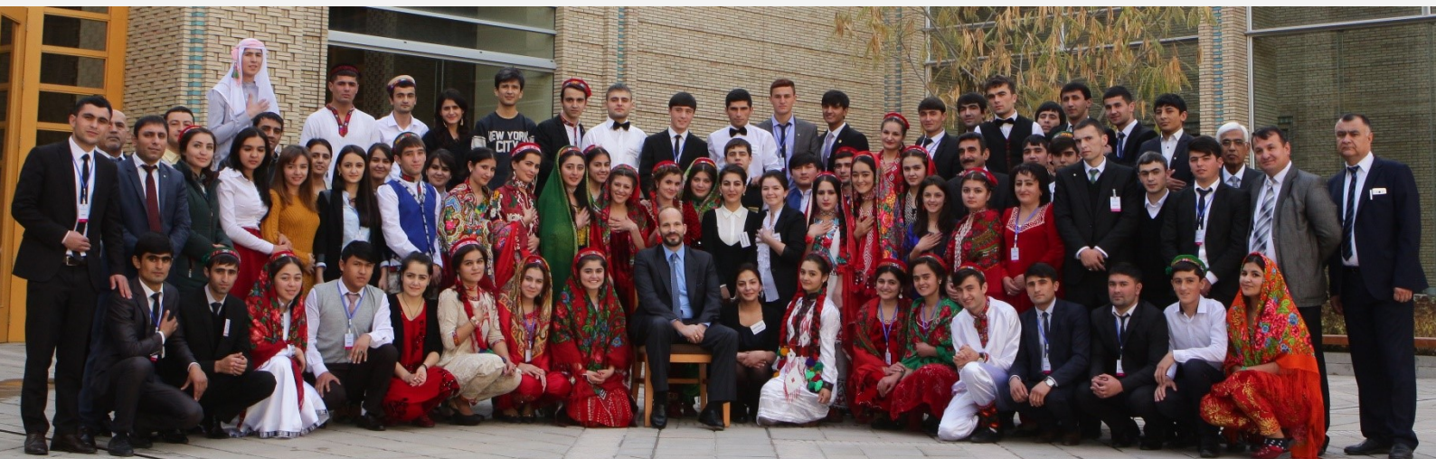
Prince Hussain ( in the middle ) with a group of volunteers of the Ismaili Centre Dushanbe