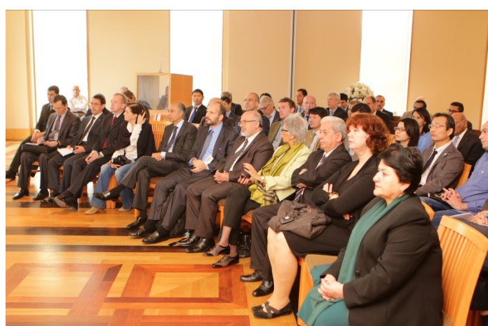
Prince Hussain, Representatives of the Diplomatic community in Tajikistan and AKDN international leadership during a workshop at ICD