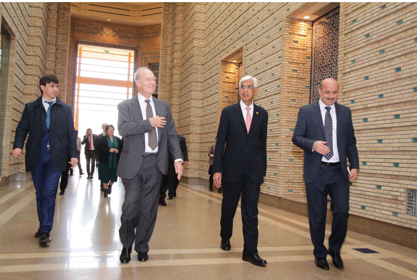
Prince Ayn touring the Ismaili Centre Dushanbe