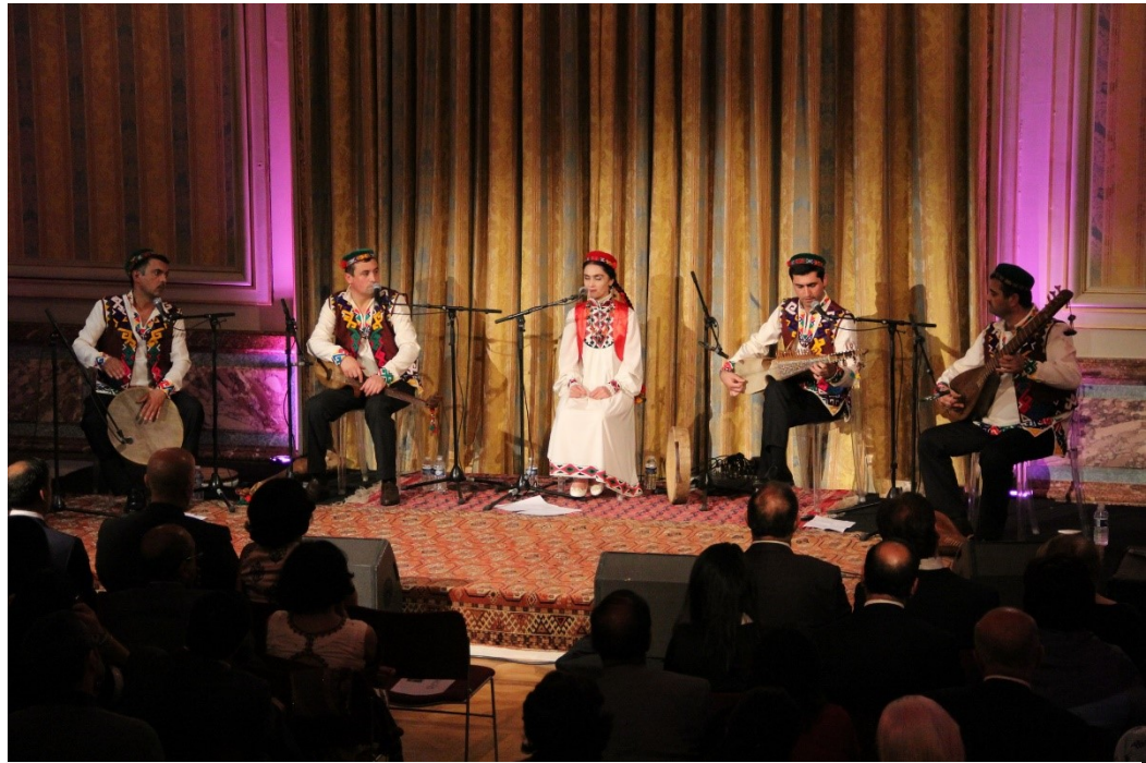
Badakhshani Ensemble's performance during their European tour

In Paris, Badakhshan ensemble played at the International Diplomatic Academy building in front of an audience comprised of enthusiasts of Central-Asian music, researchers and representatives of the Ismaili Jamaat living in France.