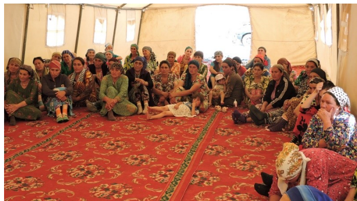
Jamaati women in Barsem (a village that was affected by the summer mudflows) during the meeting with the head of Women's Portfolio of the National Council

Throughout the meetings it was noted that such seminars of various committees of the National Council should be held across the country on a permanent basis.