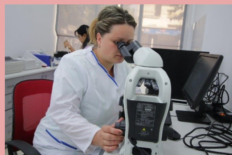
One of the specialists of the Centre's laboratory