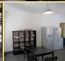
The newly constructed and rehabilitated buildings of Bibi Fatima spring