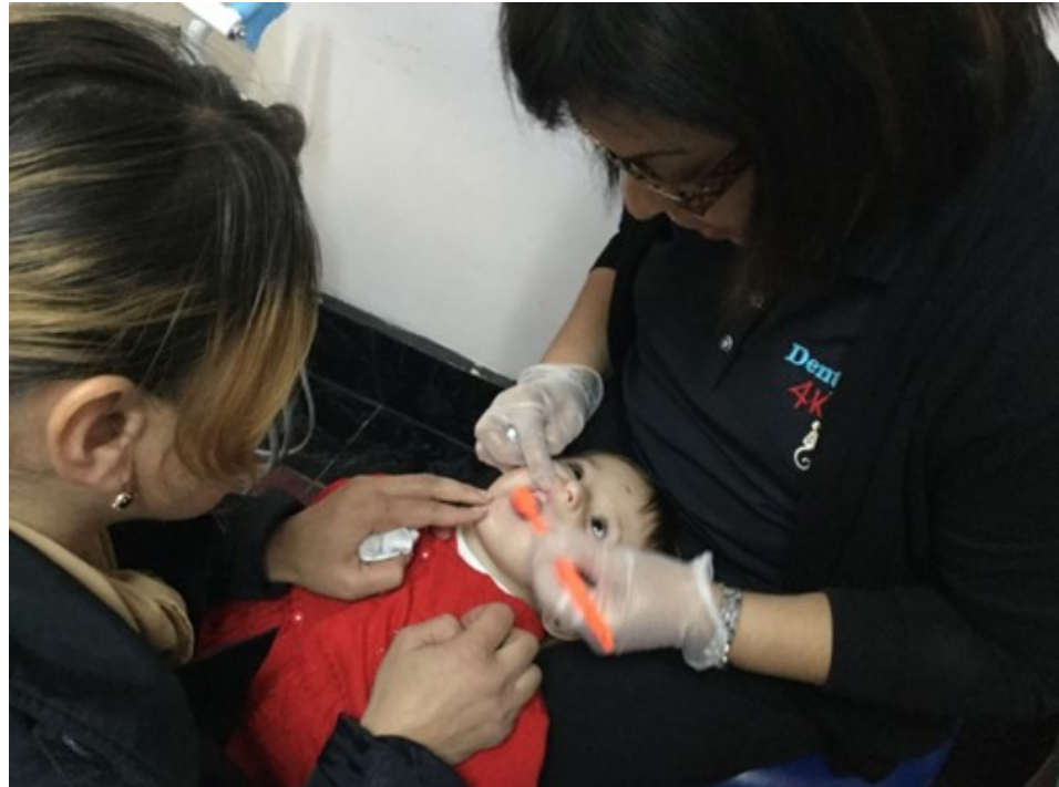
One of the dental surgeons (volunteer) checking a child patient

In November one dentist, specialised specifically on children’s dental care introduced new methods of providing quality dental care to our younger patients. In the last year the Dental Unit has served over 6,427 patients in GBAO, provided its patients with 12,000 dental procedures.